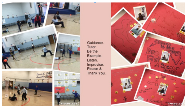
Above: 490 Fall 2016 Partnerships Presentation by students working on the Communities in Schools of Chicago project